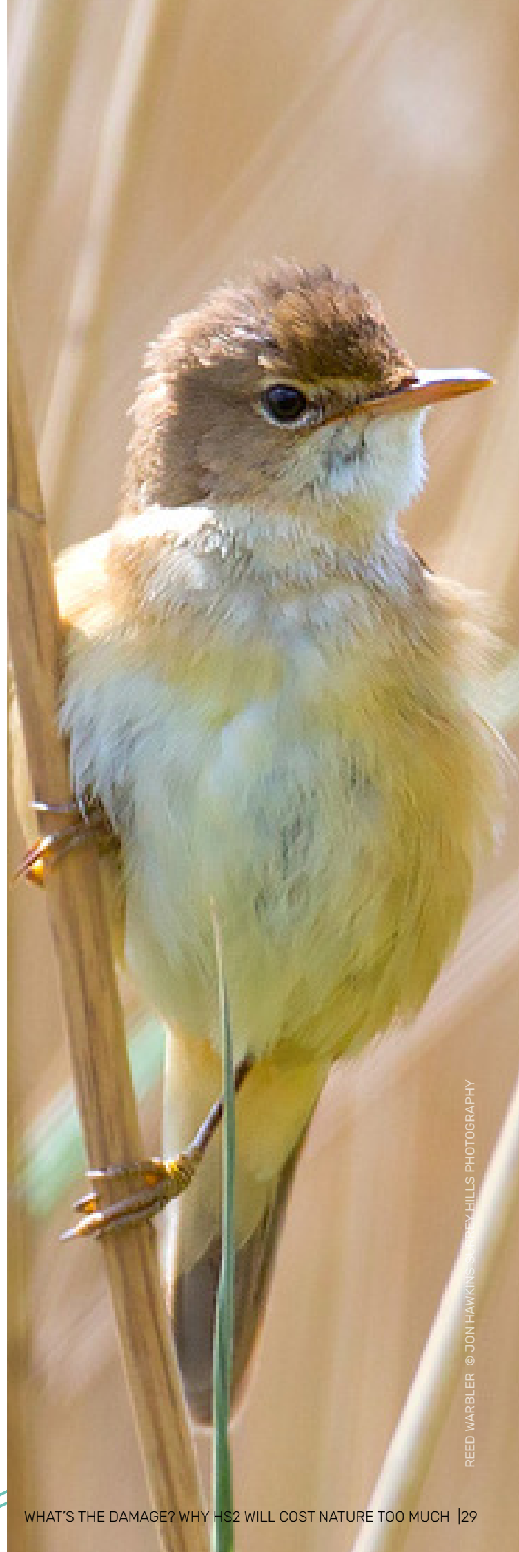
REED WARBLER

The level and scale of detail of mitigation and compensation measures falls short for a project of this magnitude. Far smaller projects provide a greater level of detail. The loss of LWS and / or priority habitat types requires a more bespoke approach in terms of mitigation and compensation that provides a net gain for biodiversity and is, as far as possible, based on a like-for-like approach in terms of habitat types lost and replaced (area provided should be greater than like for like under 'no net loss').