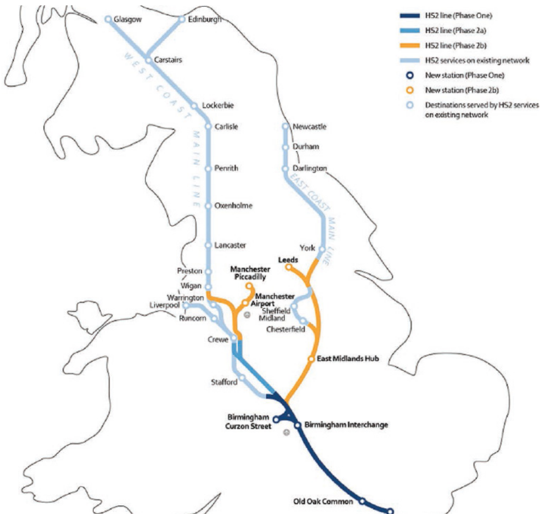
Route of HS2

It also grants the necessary changes to existing legislation to facilitate construction and operation of Phase 1 of HS2. Changes to the bill are covered by Additional Provisions 4 .